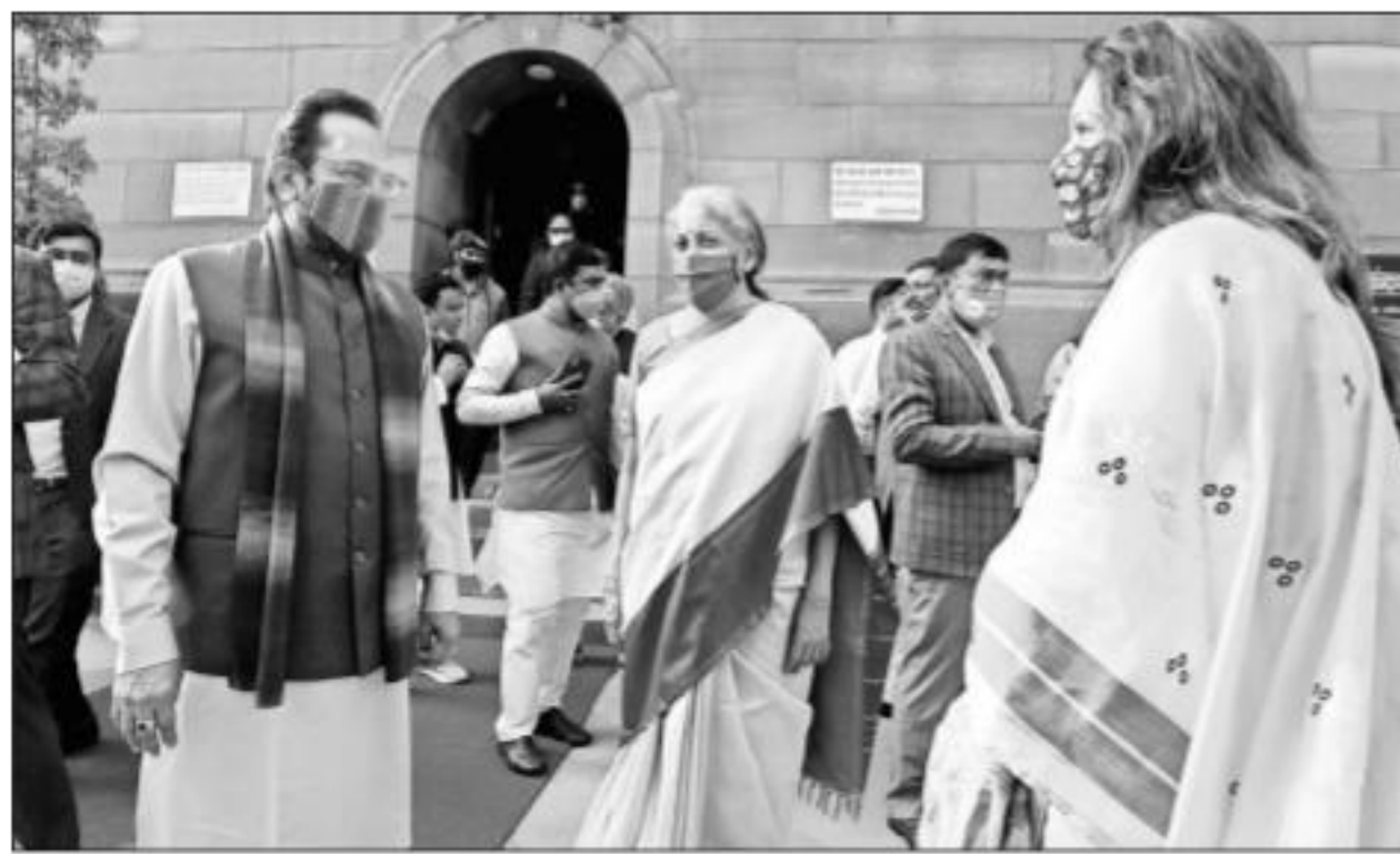
Union ministers Nirmala Sitharaman, Mukhtar Abbas Naqvi with Shiv Sena MP Priyanka Chaturvedi at Parliament House.

Anurag Thakur also countered the Opposition's allegations in his speech. He said the Budget will help make the country atmanirbhar or self-reliant. Unlike the government led by Prime Minister Manmohan Singh, he said, there was no corruption charge against the Modi government. "Doctor saab [referring to Singh] was an honest man but there was no department under him where there was no corruption," he said. Thakur also blamed the Congress for "sinking" Air India.